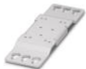
Universal wall adapter for securely mounting the device in the event of strong vibrations. The device is screwed directly onto the mounting surface. The universal wall adapter is attached on the top/bottom.