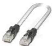
Patch cable, CAT5, assembled, 2 m

Patch cable - FL CAT5 PATCH 2,0 - 2832289