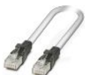
Patch cable, CAT5, assembled, 5 m

Patch cable - FL CAT5 PATCH 5,0 - 2832580