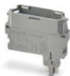
Component connector, for installing components that can be individually selected up to a diameter of 10 mm and power dissipation of up to 1 W, nominal current: 10 A, length: 41.2 mm, width: 12.3 mm, height: 37.5 mm, number of positions: 1, color: gray

Component connector - P-CO XL-UT - 3036799