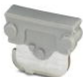
Feed-through connector, length: 10.5 mm, width: 4 mm, color: gray

Feed-through connector - P-FIX - 3038956