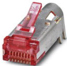
RJ45 male insert, CAT6, 8-pos., shielded, IDC pierce connection, for AWG 27 litz wires ... 24, with strain relief

Please be informed that the data shown in this PDF Document is generated from our Online Catalog. Please find the complete data in the user's documentation. Our General Terms of Use for Downloads are valid ( http://phoenixcontact.com/download )