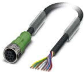
Sensor/actuator cable, 8-position, PUR halogen-free, black-gray RAL 7021, free cable end, on Socket straight M12, A-coded, cable length: 3 m

Please be informed that the data shown in this PDF Document is generated from our Online Catalog. Please find the complete data in the user's documentation. Our General Terms of Use for Downloads are valid ( http://phoenixcontact.com/download )