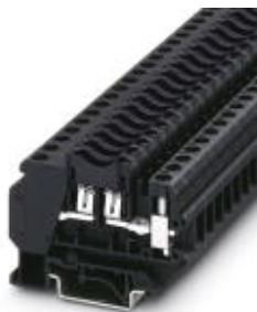
Flat-type fuse terminal block, cross section: 0.2 - 6 mm 2 , AWG: 26 - 8, width: 8.2 mm, color: black

Please be informed that the data shown in this PDF Document is generated from our Online Catalog. Please find the complete data in the user's documentation. Our General Terms of Use for Downloads are valid ( http://phoenixcontact.com/download )