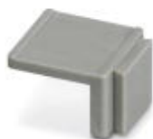
Equipment marker, narrow

Marking material - EMG-SGKS 10 - 2947585