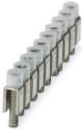
Fixed bridge, pitch: 6 mm, number of positions: 10, color: silver

Please be informed that the data shown in this PDF Document is generated from our Online Catalog. Please find the complete data in the user's documentation. Our General Terms of Use for Downloads are valid ( http://phoenixcontact.com/download )