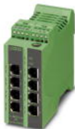
Ethernet Lean Managed Switch with eight 10/100 Mbps RJ45 ports

Please be informed that the data shown in this PDF Document is generated from our Online Catalog. Please find the complete data in the user's documentation. Our General Terms of Use for Downloads are valid ( http://phoenixcontact.com/download )