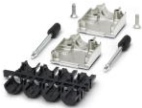
POWER-SUBCON cable housing, 3-pos.

Please be informed that the data shown in this PDF Document is generated from our Online Catalog. Please find the complete data in the user's documentation. Our General Terms of Use for Downloads are valid ( http://phoenixcontact.com/download )