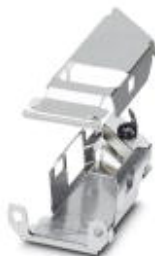
D-SUB EMC inner sleeve, for sleeve housing VS-09-..., shell size 1, shielded

Please be informed that the data shown in this PDF Document is generated from our Online Catalog. Please find the complete data in the user's documentation. Our General Terms of Use for Downloads are valid ( http://phoenixcontact.com/download )