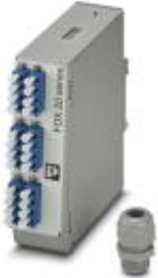
DIN rail splice box, fully mounted ready to splice, for 12x LC duplex (OS2)

Please be informed that the data shown in this PDF Document is generated from our Online Catalog. Please find the complete data in the user's documentation. Our General Terms of Use for Downloads are valid ( http://phoenixcontact.com/download )