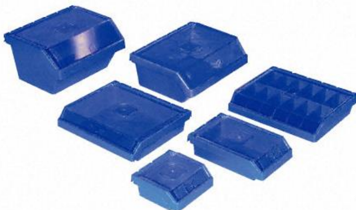
Image representative of range