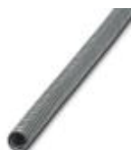
Galvanized steel protective hose, 1 Pcs. / Pkt. = roll à 10 m