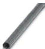
Stainless steel protective hose, 1 Pcs. / Pkt. = roll à 10 m