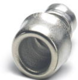
End sleeves as cable protection, made of brass

Please be informed that the data shown in this PDF Document is generated from our Online Catalog. Please find the complete data in the user's documentation. Our General Terms of Use for Downloads are valid ( http://phoenixcontact.com/download )