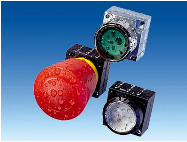
ACTUATOR PUSHBUTTON WITH FLAT PUSHBUTTON GREEN