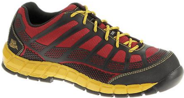
True Red/ Black/Yellow: P717357 Gender: Men's