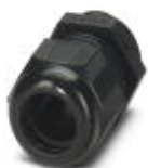
Cable gland, Cable gland material: Polyamide 6, External cable diameter 11 mm ... 17 mm, Shielding: No, Connecting thread: M25, Color: jet black

Cable gland - G-INS-M25-M68N-PNES-BK - 1411134