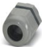
Cable gland, Cable gland material: Polyamide 6, External cable diameter 11 mm ... 17 mm, Shielding: No, Connecting thread: M25, Color: silver grey

Cable gland - G-INS-M25-M68N-PNES-GY - 1411126