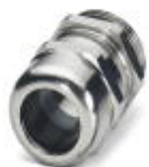
Cable gland, Cable gland material: Brass, nickel-plated, External cable diameter 11 mm ... 17 mm, Shielding: No, Connecting thread: M25, Color: silver

Cable gland - G-INS-M25-M68N-NNES-S - 1411165