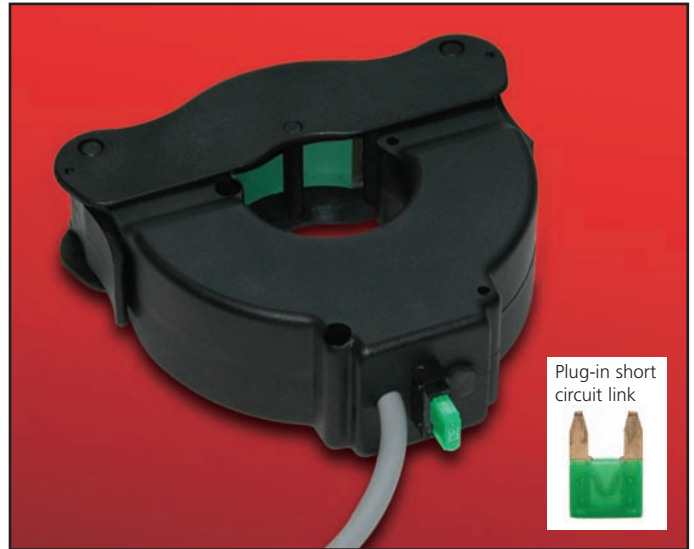
Plug-in short circuit link