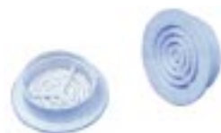
Plastic ventilation louvres