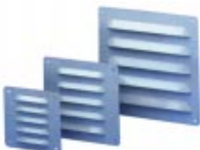
Metal ventilation louvres