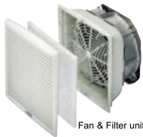
Fan & Filter units