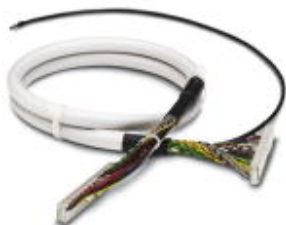
Assembled, shielded round cable, with two 16-pos. socket strips (1:1 connection), length: 5 m

Please be informed that the data shown in this PDF Document is generated from our Online Catalog. Please find the complete data in the user's documentation. Our General Terms of Use for Downloads are valid ( http://phoenixcontact.com/download )