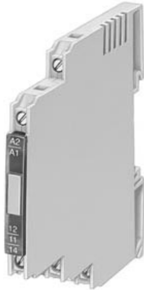
OUTPUT INTERFACE TWO-TIER TERMINAL-TYPE COUPLING RELAY 1NO, AC/DC 230V SCREW TERMINAL WIDTH 6.2MM