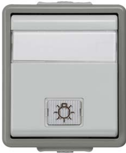
DELTA FLAT IP44, SM DARK GRAY/LIGHT GRAY 2-WAY SWITCH, 10A 250V W.WINDOW, LAB. PLATE, GLOW LAMP 66X75MM