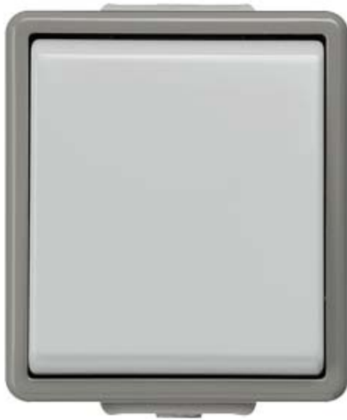
DELTA FLAT IP44, SM DARK GRAY/LIGHT GRAY OFF SWITCH 1POLE, 10A 250V 66X75MM