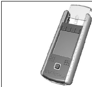
Figure 1. EvoPrimer base