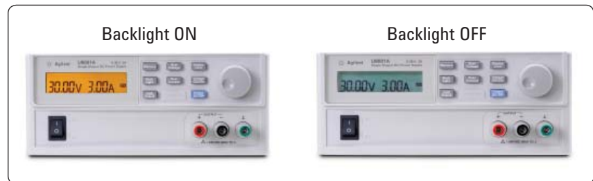
Figure 2. Backlight on/off options for LCD display