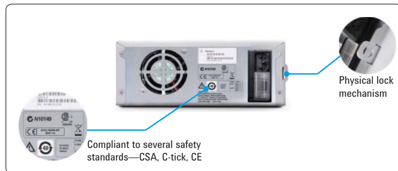
Figure 3. Safety and security features of the U8000 Series single output DC power supplies