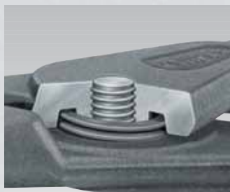
Spring inside the joint: the spring is protected inside the precision screw joint. It does not hinder work and can't get dirty or lost