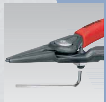
49 31 A0/49 41 A01: with adjustable opening area