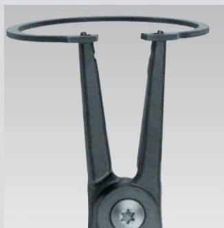
KNIPLEX Precision Circlip Pliers: fit circlips without distortion; easy and quick assembling