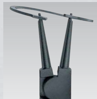
Conventional Circlip Pliers: distortion of the circlip when being fitted is possible