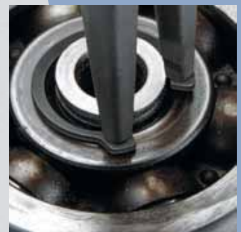
Heavy duty tips: optimum stability when loosening tight circlips