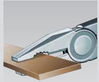
Gripping zone for flat material