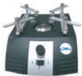
PCT-100 with integrated boardholder BH-010